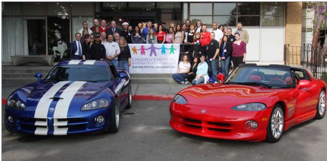
ABOVE: VCA members and BAMF supporters join Children's Hospital in Oakland in hosting the first Build-A-Viper charity bash.