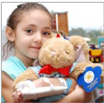
TOP: Club members help young patients build their Vipers.